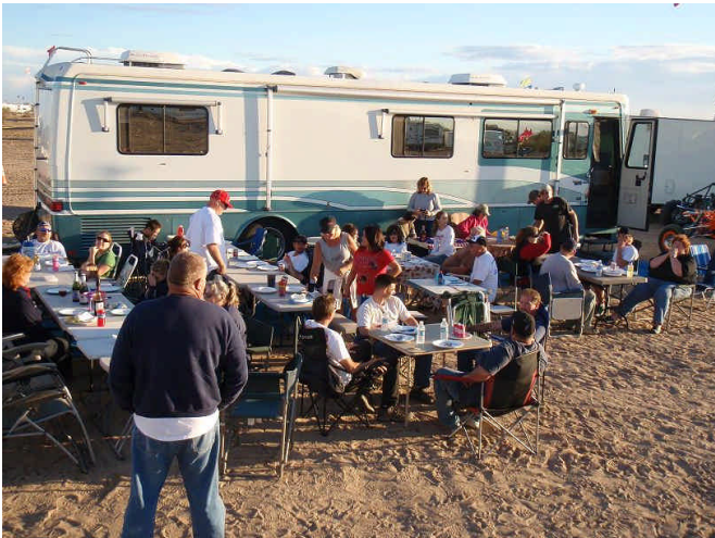
The Thanksgiving Potluck was once again a success.