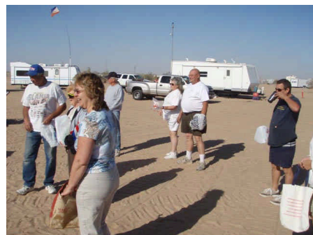
Adults waiting to hunt eggs.