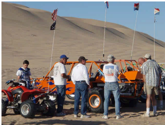
Sunday afternoon's ride group at Buttercup.