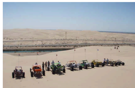
Overlooking I-8 above test hill.