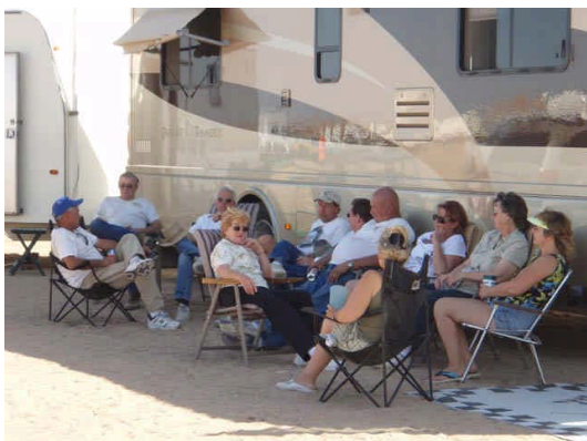
Relaxing in camp on Saturday.