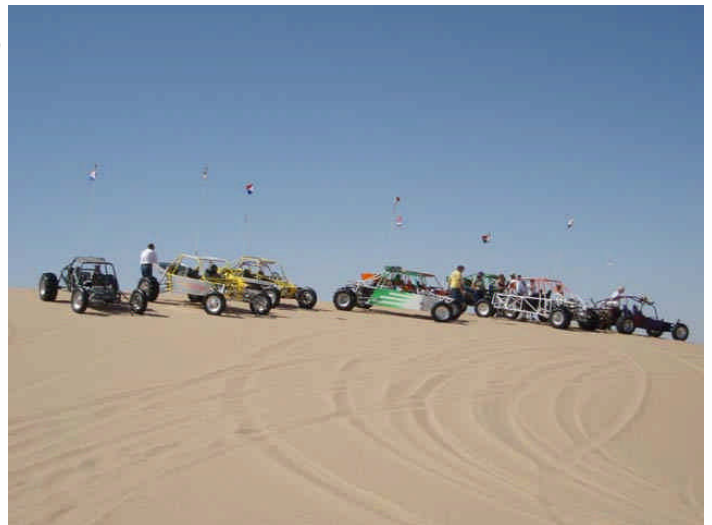
The group from Sunday morning's ride.