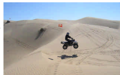
ED LOER JUMPING.

quickly and we spent some quality time around the fire. Justin shot off some big fireworks. Candy and hot peanuts were passed around several times until we all retired to the warm RV's. Sunday was another picture perfect day. Jim led a group of 6 buggies on a fast buggy ride. All of us came home in one piece and just in time for the 2 NFL playoff games. Go Chargers!!!!!!!!!! 3 hours later and bummed out we squeezed