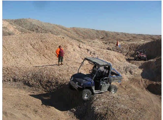
ANZA BORREGO OFFERS SOME DIVERSE TERRAIN TO EXPLORE ON THE RANGERS.

After lunch we went on another ride, this time down one of the washes towards the Salton Sea. As we drove down the wash I noticed an odd colored area off to the left, so we rode over to see what it was. We found a small area of oddly colored and shaped rocks, some appearing to be rocks within other rocks. Absolutely no reason why this would be there, it matched nothing else in the area. Very odd, but very interesting!