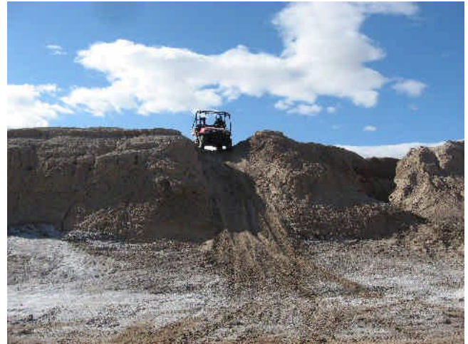
THAT TRAIL DOESN'T LOOK SO NARROW.