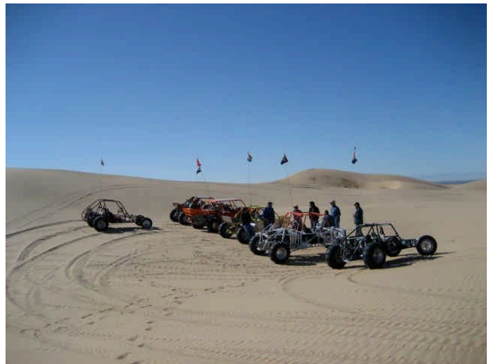
THE GROUP FROM ONE OF THE RIDES.