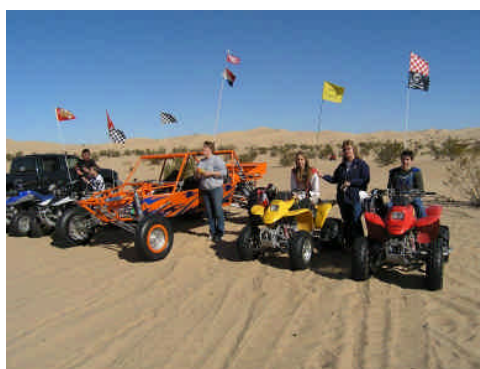
THE HAGENS AND LOERS AT OLDSMOBILE.

enjoyed watching the kids ride thru the bigger bowls. They have turned into really good quad riders. Bringing them to the dunes since