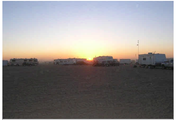
SUNSET OVER THE CLUB CAMP.

-The Fallbrook Four and Rudy the Duning Dachshund