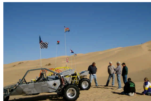
DISCUSSION DURING A RIDE BREAK.